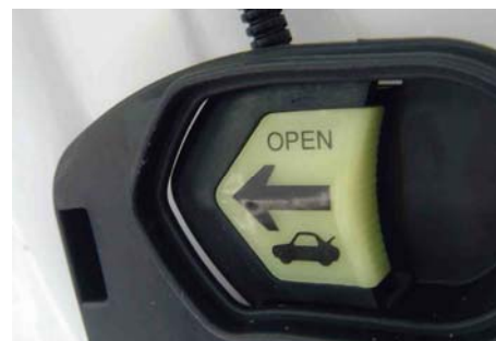
Truck release handle